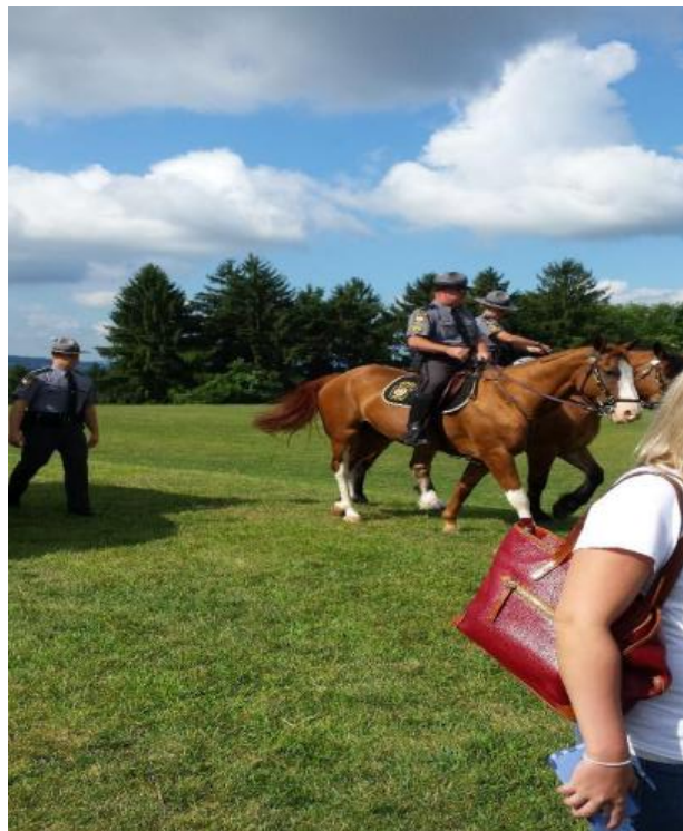
Now he's got it!