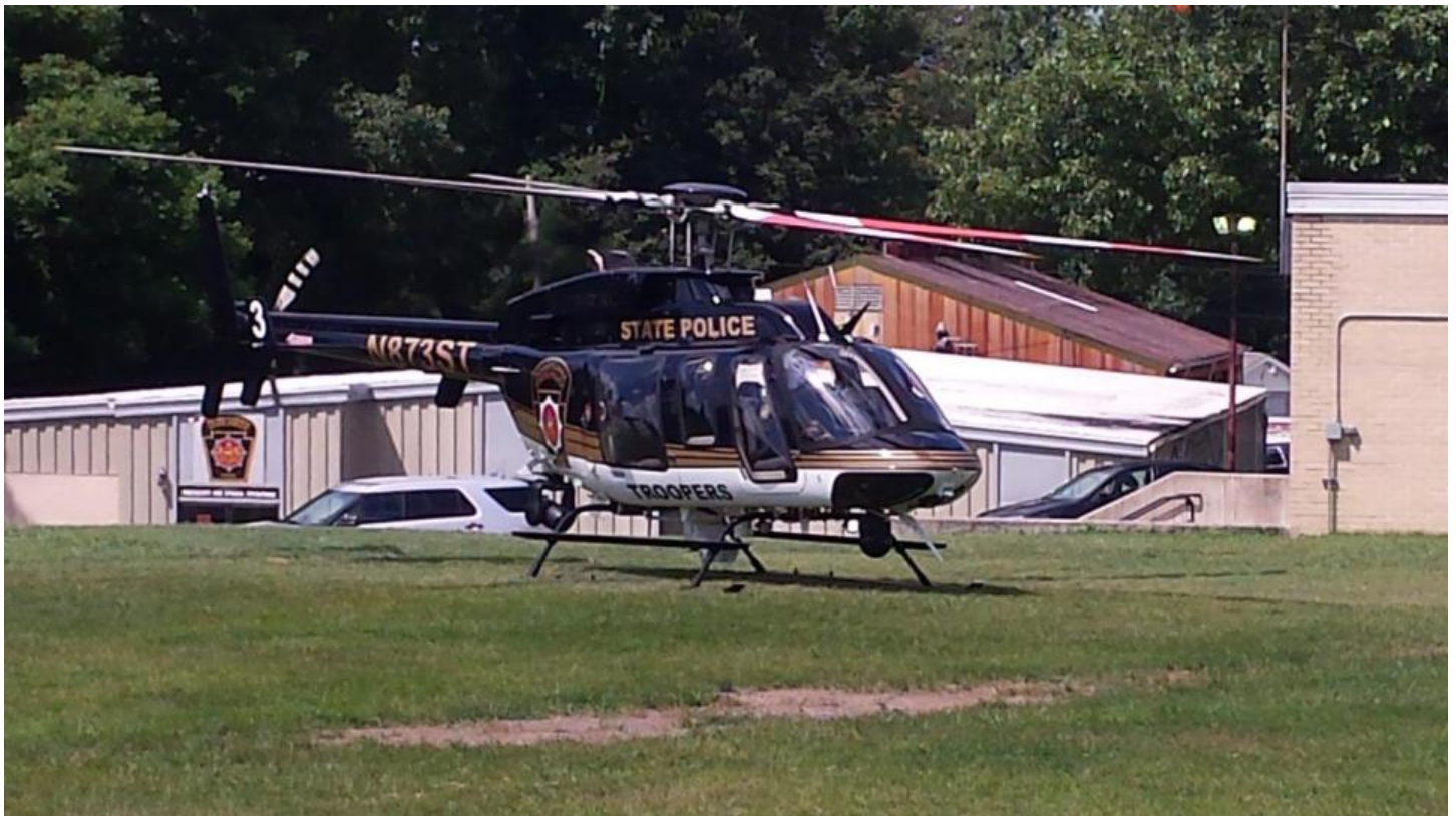
No day as a Jr. State Trooper would be complete without a ride in the official State Police helicopter!